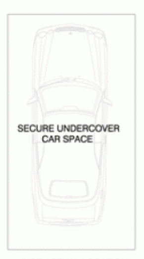
(NOT ACTUAL LOCATION)