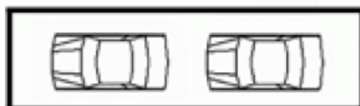
Double Remote Lock-up Garage

Every precaution has been taken to establish the accuracy of the included information, but does not constitute any representation by the vendor or agent. Interested parties should make their own enquiries to verify the information contained in this document.