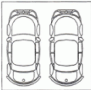
Double Security Parking

Every precaution has been taken to establish the accuracy of the included information but does not constitute any representation by the vendor or agent. All interested parties should make their own enquiries to verify the information contained in this document. Refer to contract of sale for actual inclusions.