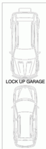
LOCK UP GARAGE