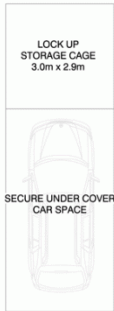
(NOT ACTUAL LOCATION)