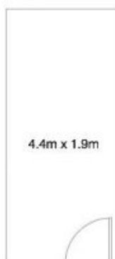
STORAGE CAGE (NOT ACTUAL LOCATION)

ROZELLE 1012/27 MARGARET STREET "Quarter Deck" - Balmain Shores