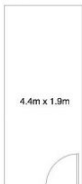
STORAGE CAGE (NOT ACTUAL LOCATION)