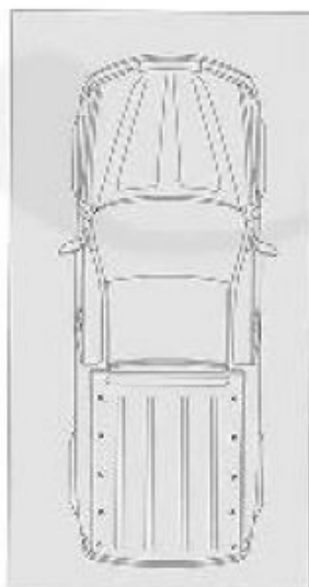
SHARED PARKING (NOT ACTUAL LOCATION) (NOT TO SCALE)