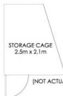
STORAGE CAGE 2.5m x 2.1m (NOT ACTUAL LOCATION)