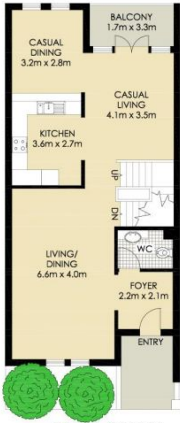
TERRY STREET GROUND FLOOR