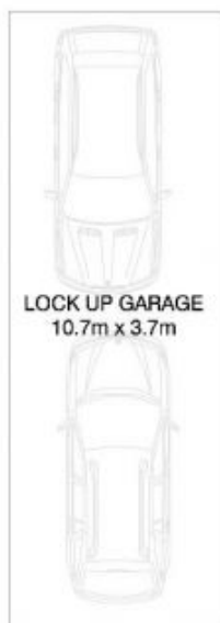
LOCK UP GARAGE 10.7m x 3.7m