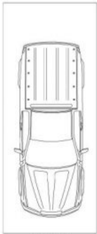
CARPORT 6.8m x 2.8m