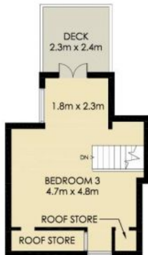
LOFT LEVEL (ABOVE MAIN RESIDENCE)