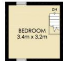
LOFT LEVEL (ABOVE STUDIO)