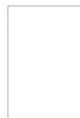
SECURE STORAGE CAGE 2.8m x 1.8m (NOT ACTUAL LOCATION)