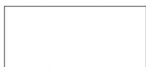
STORAGE CAGE 1.4m x 3.3m (NOT ACTUAL LOCATION)