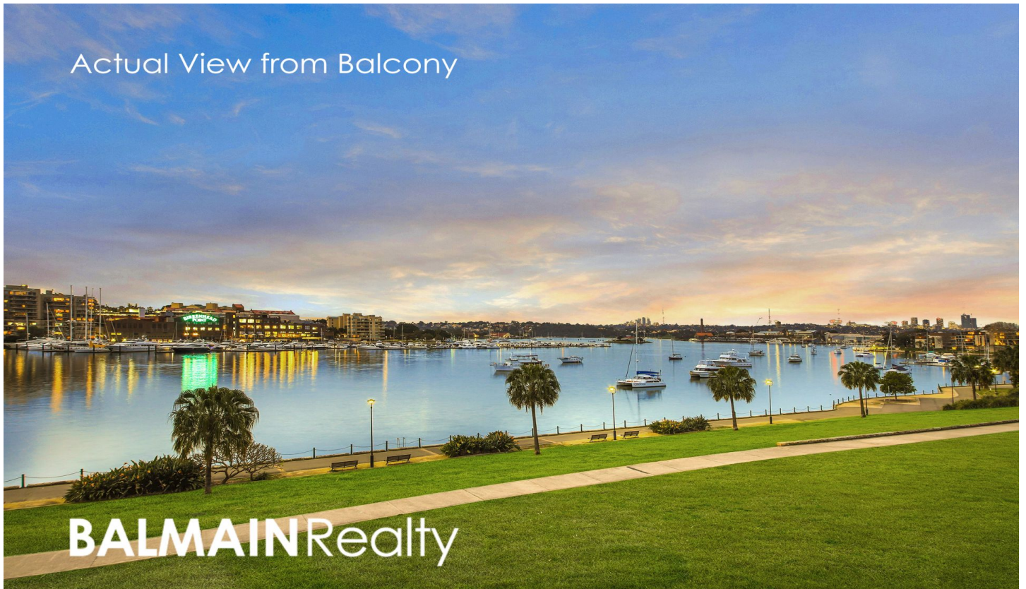
Actual View from Balcony