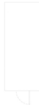
STORAGE CAGE 3.6m x 2.7m (NOT ACTUAL LOCATION)

As advertised or by private appointment.