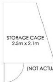
STORAGE CAGE 2.5m x 2.1m (NOT ACTUAL LOCATION)

ROZELLE 802/27 MARGARET STREET "Quarterdeck" - Balmain Shores