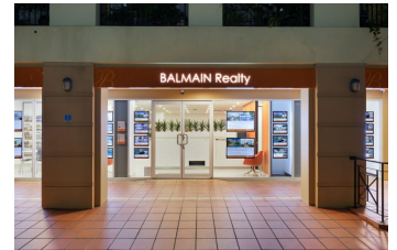
Balmain Realty Leasing (02) 9818 8888