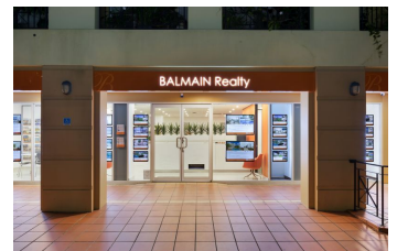
Balmain Realty Leasing (02) 9818 8888