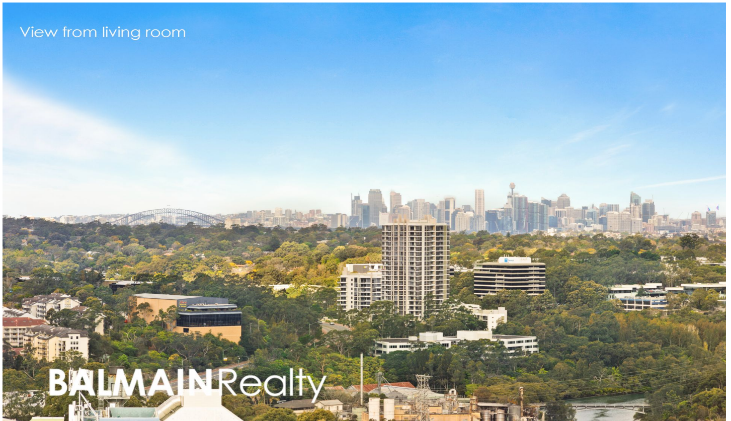
View from living room